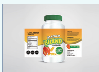
Drug label printing