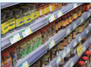
Food flexible packaging printing