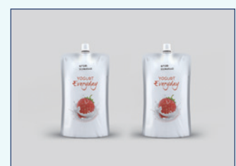
Daily chemical flexible packaging printing